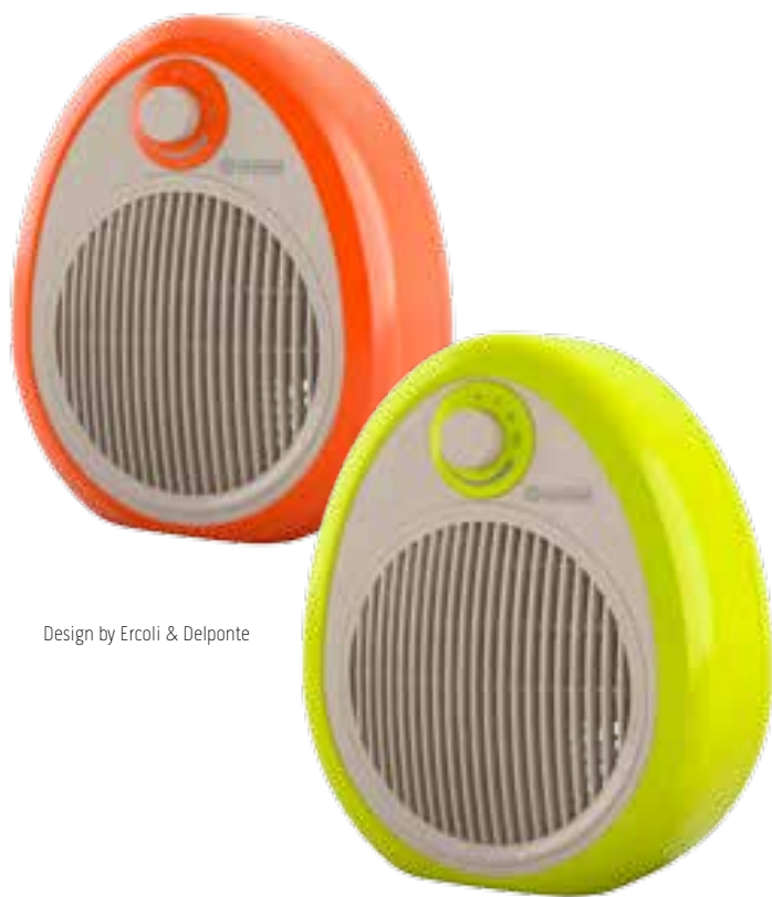
Design by Ercoli & Delponte

CROMO COLORS LIME Cod. 99520 CROMO COLORS ORANGE Cod. 99521