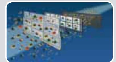
High intensity filters